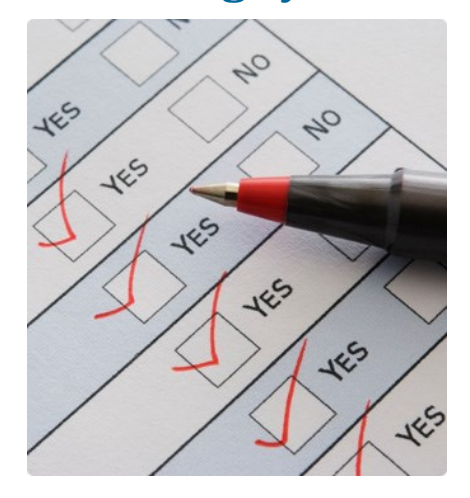
Make sure you visit the "checklists and tools" at DCAA.mil Find the Pre-Award Accounting System Adequacy Checklist. Of course, we are here to help you!

Questions? Please visit www.klineco.com or call us at 603.881.8185